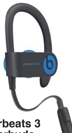
Beats Powerbeats 3 Wireless Earbuds