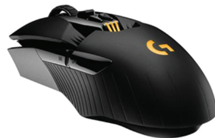
Logitech Gaming Mouse