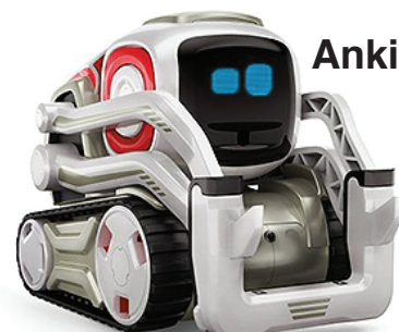
Anki Cosmo Robot