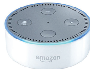
Amazon Echo Dot