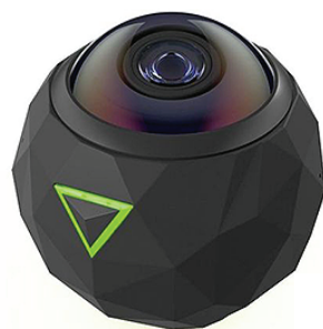
360fly 4K Action Camera